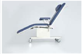
Backrest Adjustment : 0 - 60°