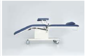
Mattress platform height : 64,5 cm