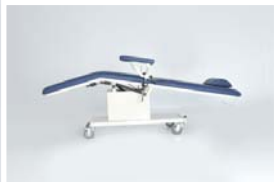
Trendelenburg position : 0 - 12°